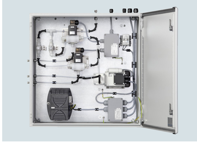
2-stream sample preparation