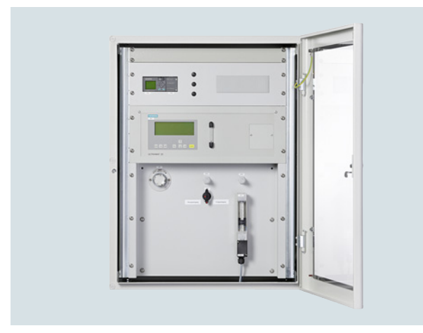
Set BGA measuring system

The ULTRAMAT 23 calibrates the IR components and the electromechanical oxygen sensor automatically with ambient air. Calibration with calibration gas is recommended once a year or after oxygen sensor replacement. In order to comply with the technical specification data, the hydrogen sulfide sensor must be calibrated every three months. An appropriate calibration gas is therefore required. It is supplied to the analyzer through a manually switchable ball valve.