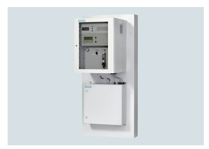
The Set BGA ( biog as a nalyzer) is a standardized system for stationary, continuous operation for the analysis of landfill gas, sewage gas or biogas.