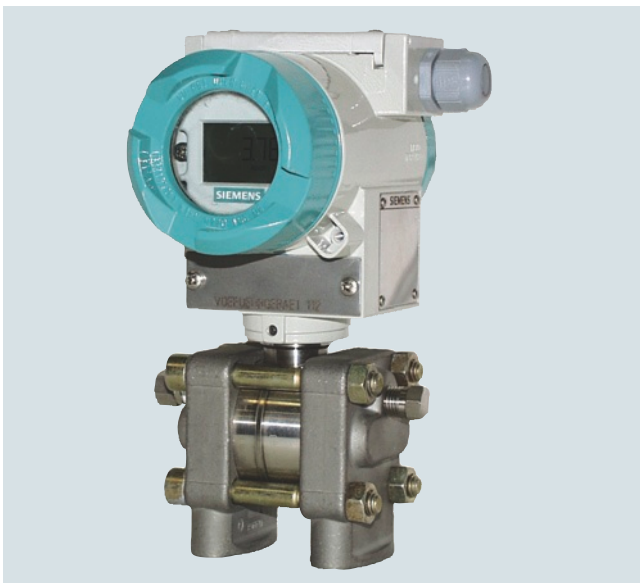
SITRANS P DS III pressure transmitters for differential pressure and flow, with process covers for vertical differential pressure lines

SITRANS P DS III pressure transmitters for differential pressure and flow, with process covers for vertical differential pressure lines, optional "H03", dimensional drawing, dimensions in mm (inch)